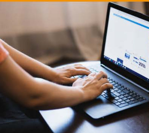
Laptops for studying or starting work