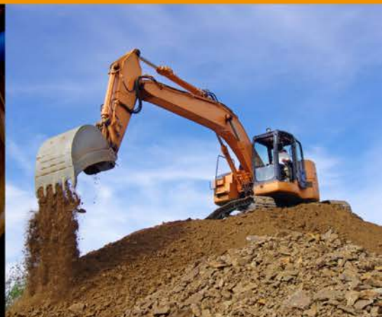
Training courses to prepare for work