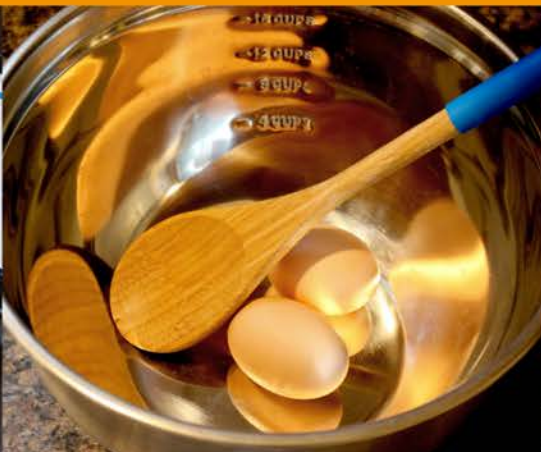
Tools or equipment for a new job